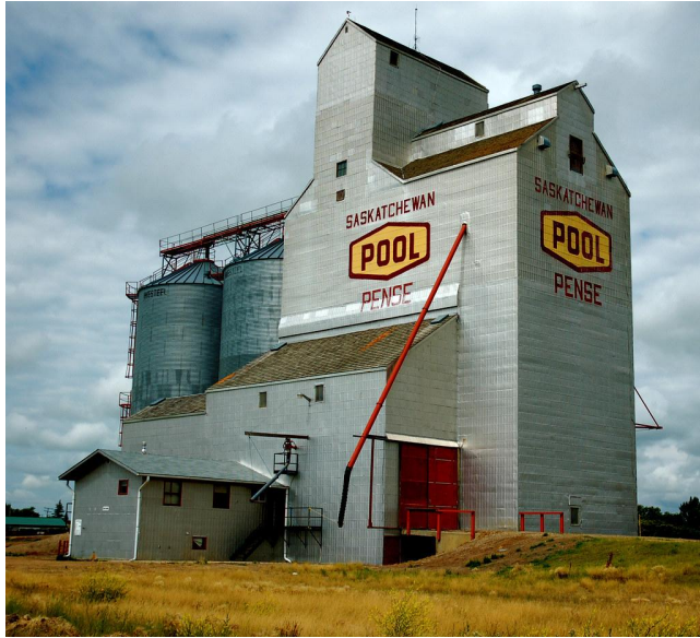
The Great Wheat Harvest of 1966

In October of 1966, prairie farmers hauled in the largest wheat crop Saskatchewan had ever seen. More than 630 million bushels of golden grain poured into bins from Estevan to Lloydminster, filling every elevator until the boards creaked. The harvest ran late that year. A cool, wet spring had pushed planting into June, and farmers raced the first frost through long October days that began before sunrise and ended under the yard light.